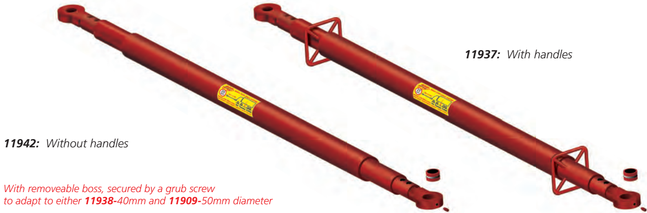
11942: Without handles

Rating: 44 Tonne End Eye Diameters: 40mm to 40mm or 50mm Weight: 47kg Length: 2350mm to centres