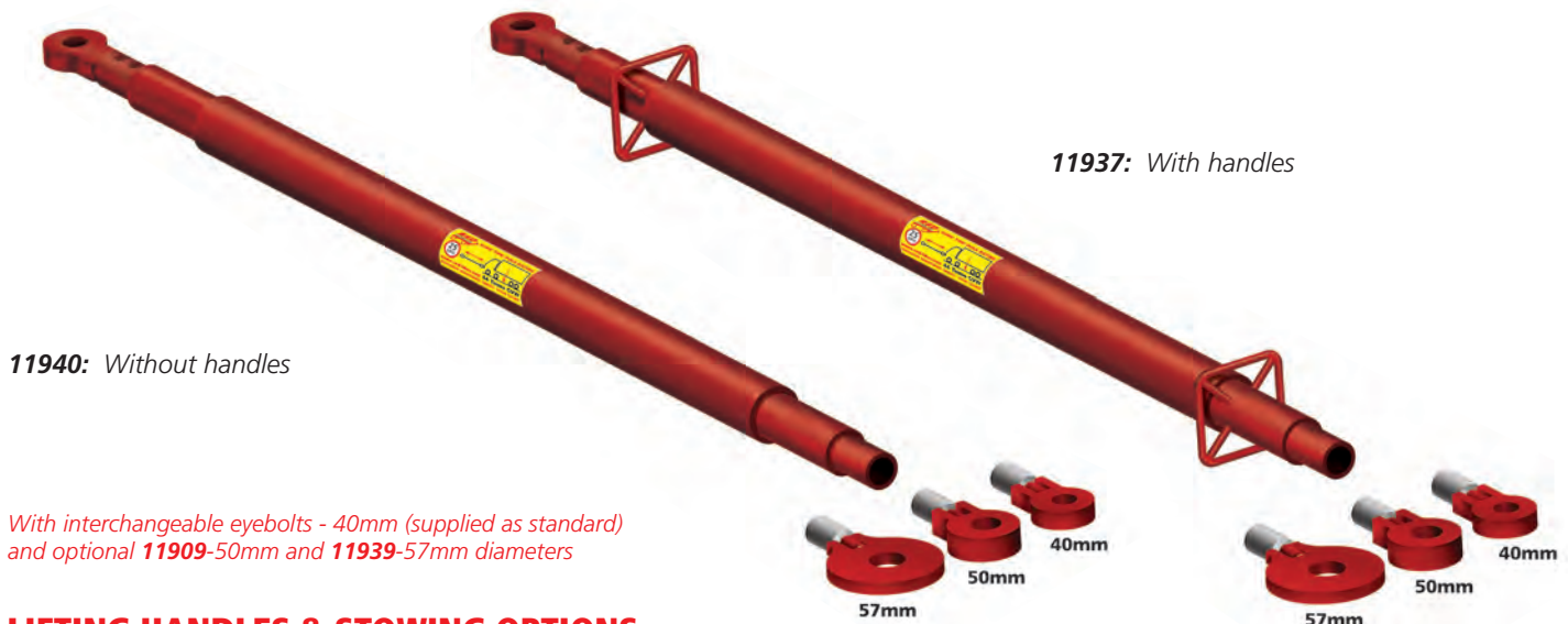
11940: Without handles

Rating: 44 Tonne End Eye Diameters mm: 40mm to 40mm, 50mm or 57mm Weight: 47kg Length: 2350mm to centres